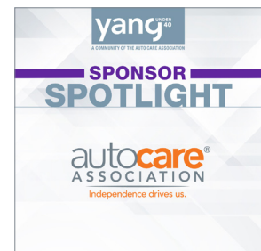
Sponsor Spotlight post on YANG's LinkedIn