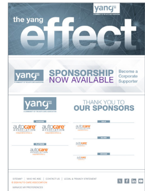
YANG Effect newsletter