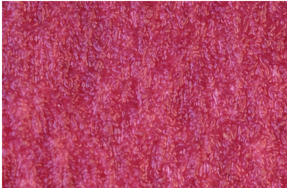
New felt media soaked in fresh automatic transmission fluid: