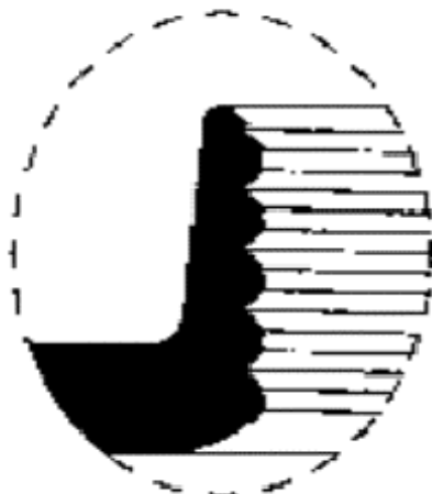
CUT THREAD DETAIL