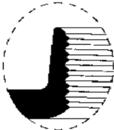
ROLLED THREAD DETAIL